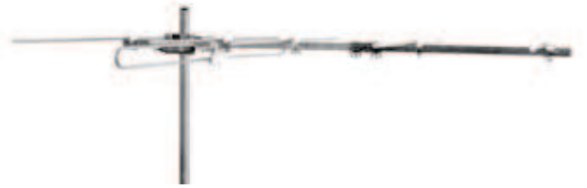
► TERZA 6HD

Important characteristics include: F connector and mast clamp with adjustable zenith.