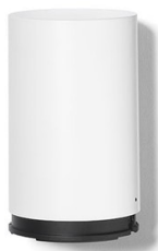
STRING LIGHT EU FLOOR SWT BCO F6484009