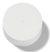
STRING LIGHT EU/UL ROSONE BCO F6482009